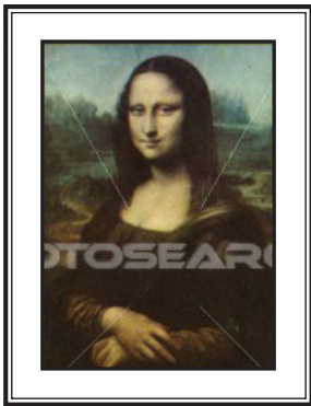
The DaVinci of Yesterday